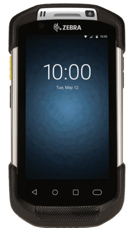
Zebra® TC75 Rugged Touch Computer